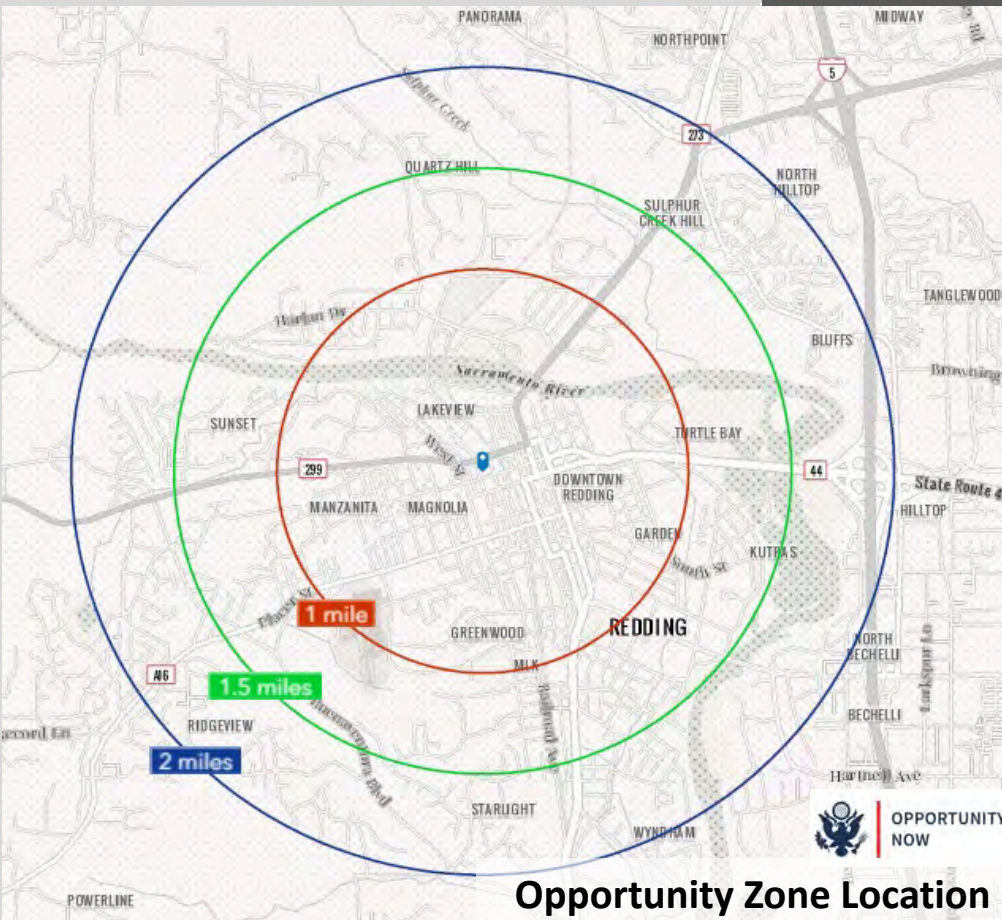
Opportunity Zone Location