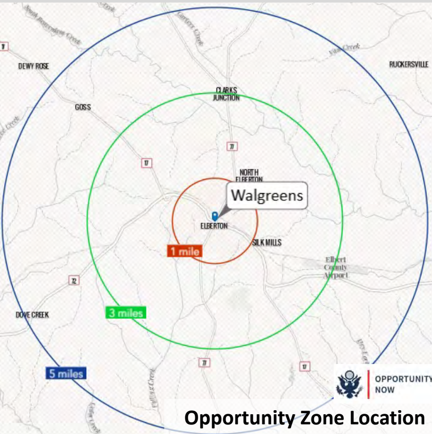
Opportunity Zone Location